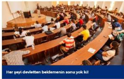
Her şeyi devletten beklemenin sonu yok kil