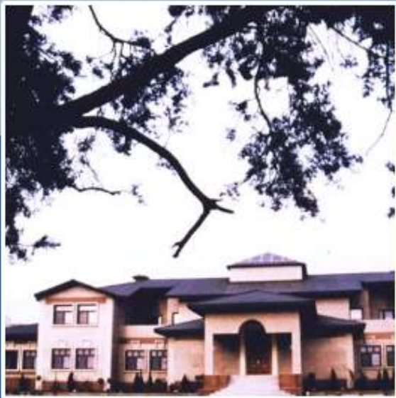
Kazakhstan Presidency Residence

Employer : Kazakhstan Republic Presidency Affairs Directorate Job Title : Presidency Residence Location : Astana / Kazakhstan Contract Date: 1997 Date of completion of the Job: 1998 Total construction site : 5.100 m 2