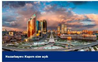
Nazarbayev: Kapım size açık