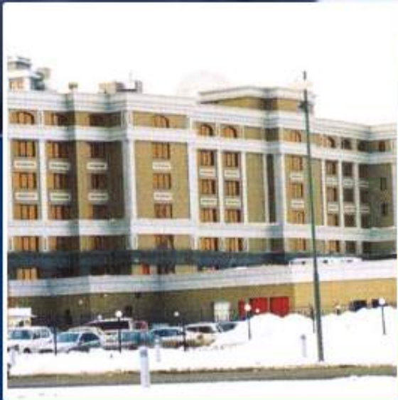
Avrasya Bank Head Office Building Astana/ Kazakhstan

Employer: Eurasian Industrial Association Bank