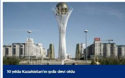
10 yılda Kazakistan'ın gıda devi oldu