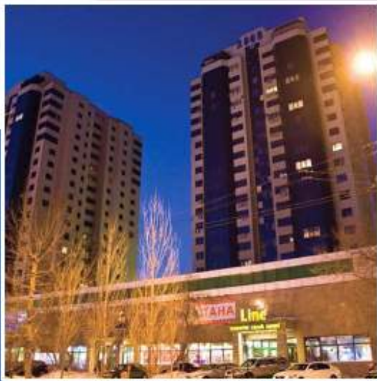
Okan Merei Astana

Employer: Alataustroyinvest Co. Job Title: Okan Merei Triple Rezidance Towers and Shopping center Location: Astana/ Kazakhstan Contract Date: 2003 Date of completion: 2008 Total Construction Site: 80.000 m2