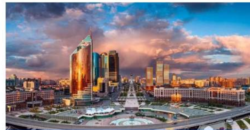
Nazarbayev: My door is open for you