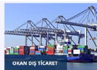
OKAN DIŞ TİCARET