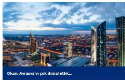
Okan: Avrasya'yı çok ihmal ettik...