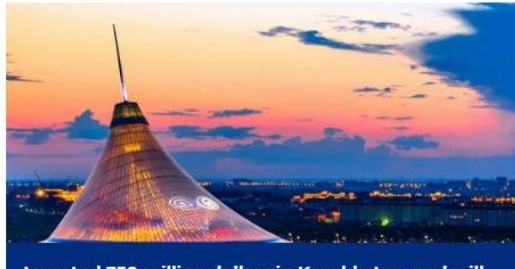
Invested 350 million dollars in Kazakhstan, and will cause spaghetti to be loved