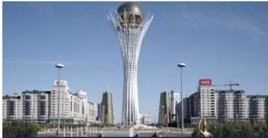
10 Became the food giant of Kazakhstan