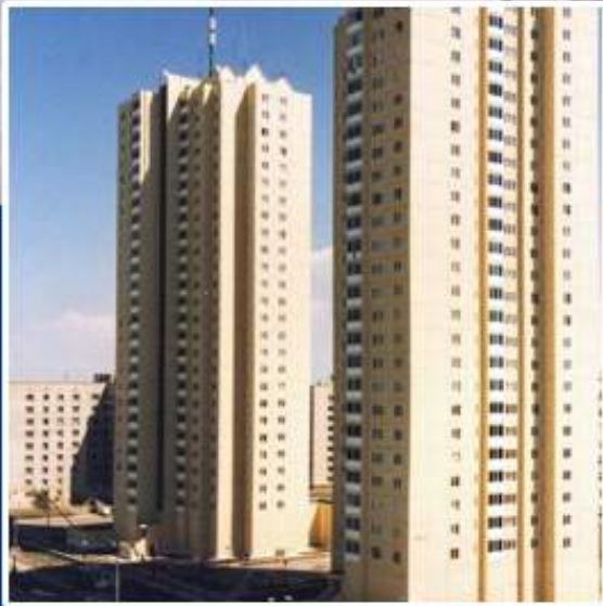
Astana Twin Towers

Employer: Kazakhstan Republic Presidency Affairs Directorate