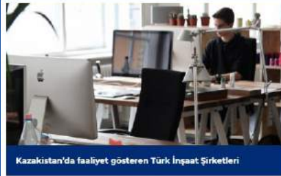
Kazakistan'da faaliyet gösteren Türk İnşaat Şirketleri