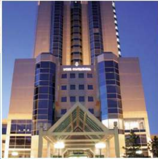
Okan Inter-Continental Astana