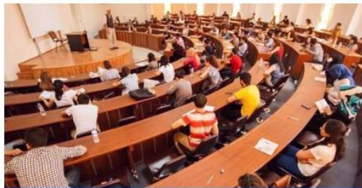
You cannot expect everything from the government!