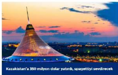
Kazakistan'a 350 milyon dolar yatırdı, spagetti'yi sevdirecek