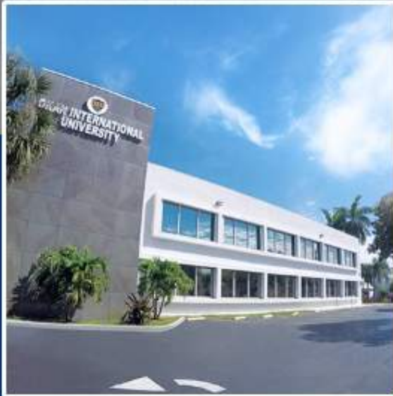
Okan International University

Okan International University was founded in 2015 under the American law in Miami with the academic support of Okan University. Students settling in Okan University can study English Language Preparatory Class at OIU in Miami.