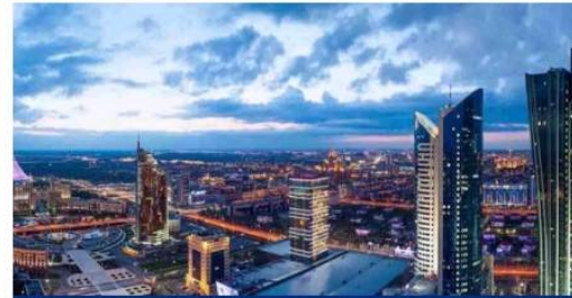
Okan: We have neglected the Eurasia so much...