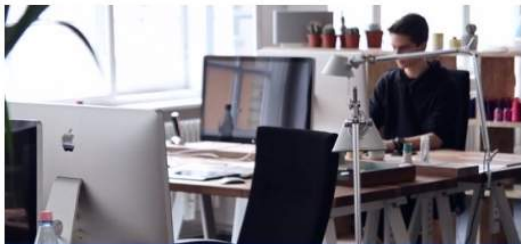
Turkish Construction Companies Operating in Kazakhstan