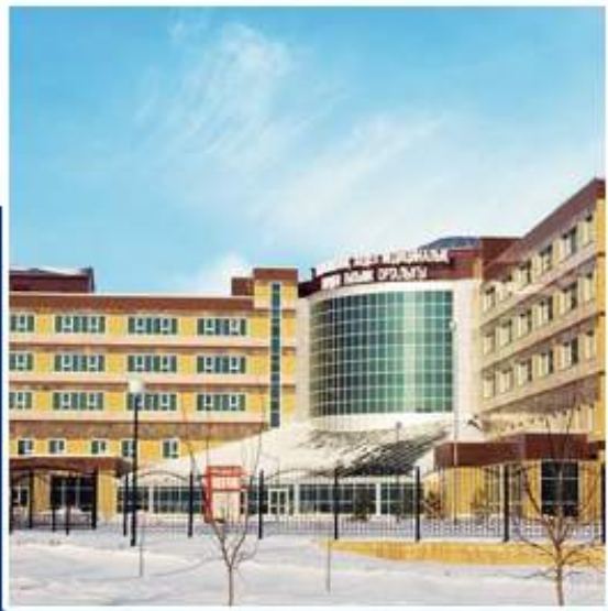
Emergency Relief Hospital